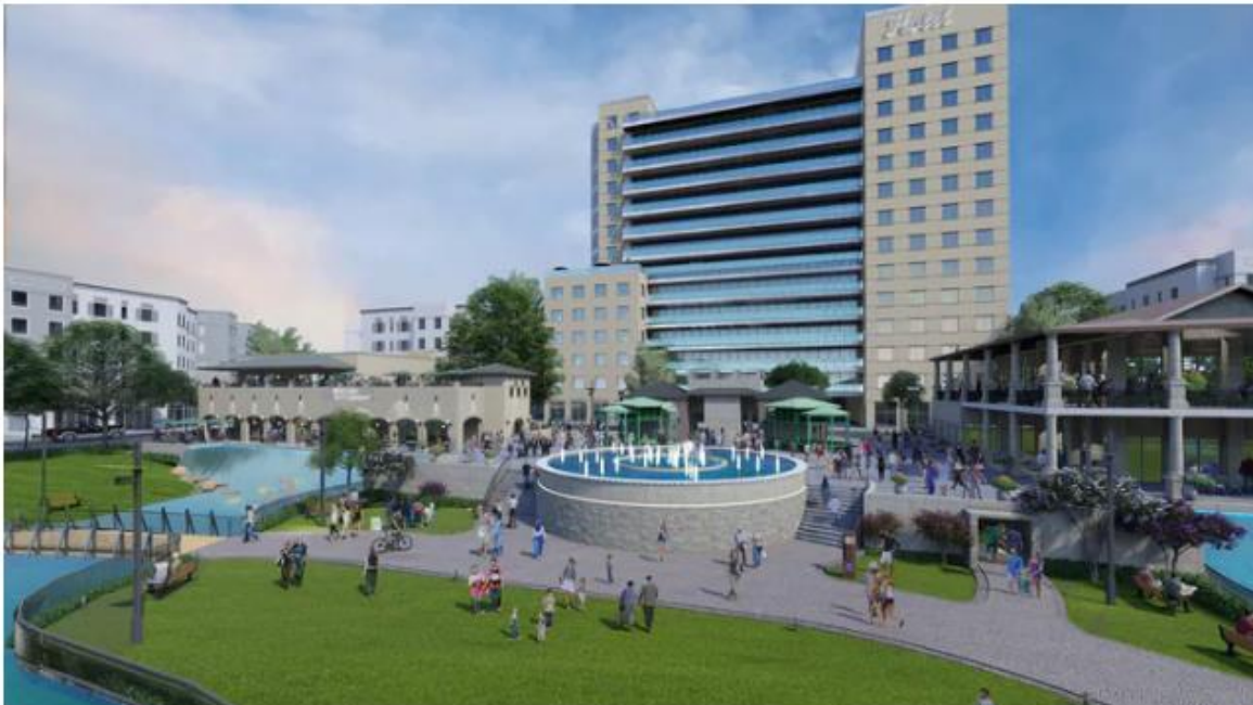
A 200-room hotel, restaurants, apartments and a water feature would be constructed in the first phase of the Collin Creek Mall project.

Centurion American is one of North Texas' biggest developers, building everything from large-scale suburban neighborhoods to historic redevelopments in downtown Dallas, including the Statler Hotel and the Cabana Hotel.