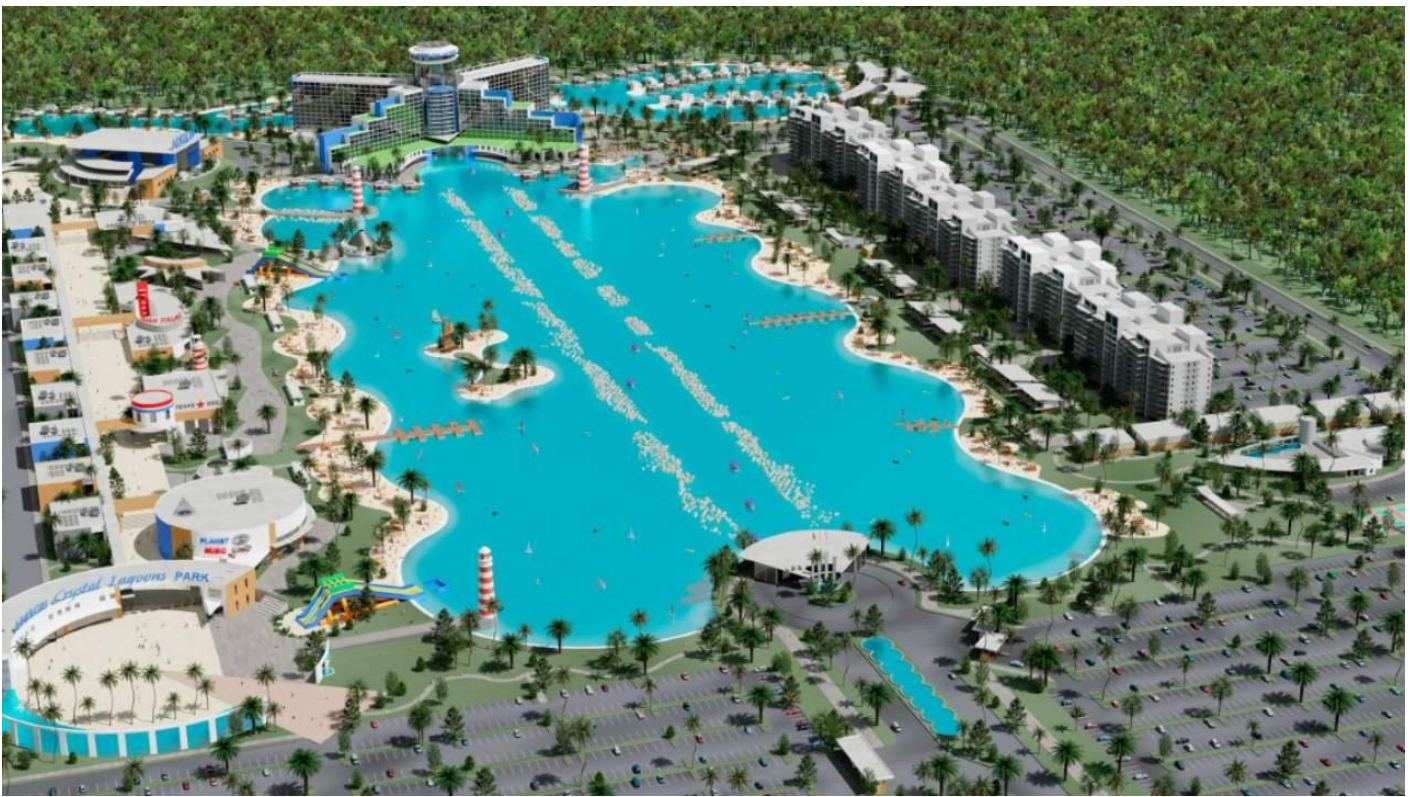
Rendering of the Crystal Lagoons project planned for construction along Bali Boulevard in Orange County (Adelon Capital)

Developing such a large parcel of land could have some major environmental impacts. The company said there are plans to mitigate those impacts, however, details on that were not readily available.