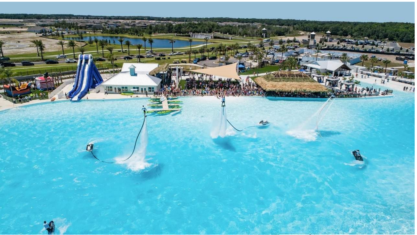
Crystal Lagoons (Crystal Lagoons)

While building near Disney may seem like an obvious choice, with its near-constant flow of tourists, Adelon believes the other locations will have plenty of customers as well.